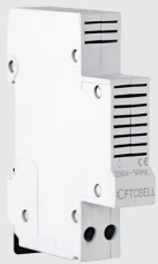
FTCBELL Ref. No. F100690

3- Under Voltage release allows MCB to be closed only when voltage is above 85% of U_n . MCB will automatically trip when voltage falls to between 70-35% of U_n . operation of the coil is indicated by flag on the product fascia 230Vac, 48Vdc